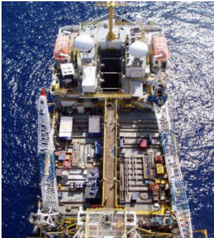
Riser decks (front)