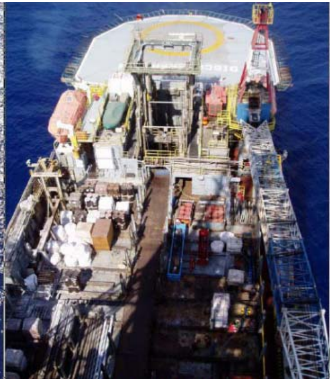
Drilling deck (rear)